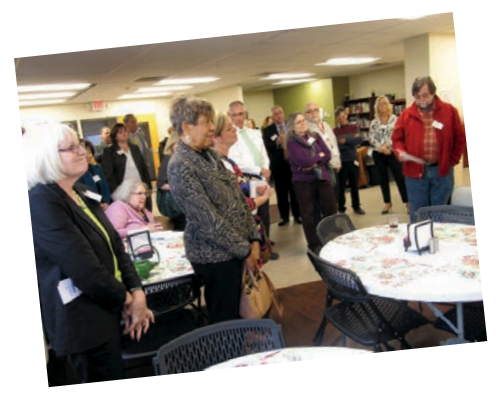
Guests gather in client day-room for a presentation of the Center's gratitude.