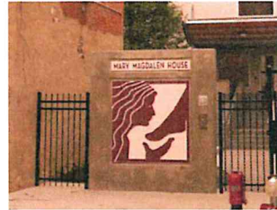
Mary Magdalen House